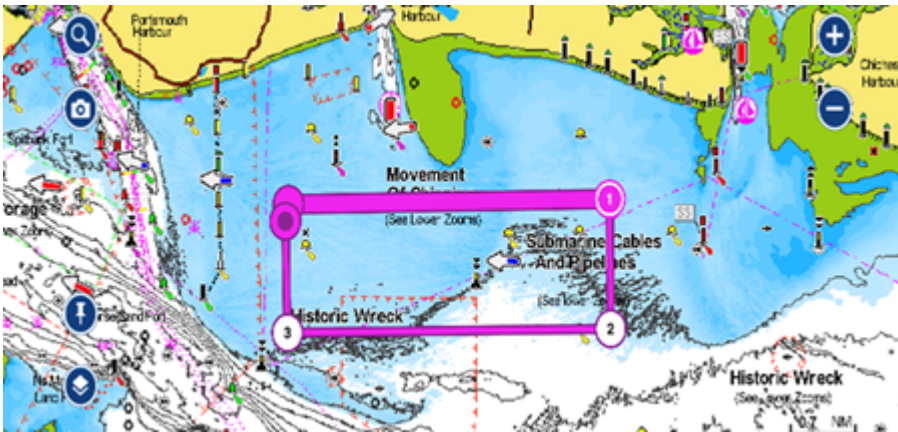
Hayling Bay operating area (Chart not to be used for navigation)