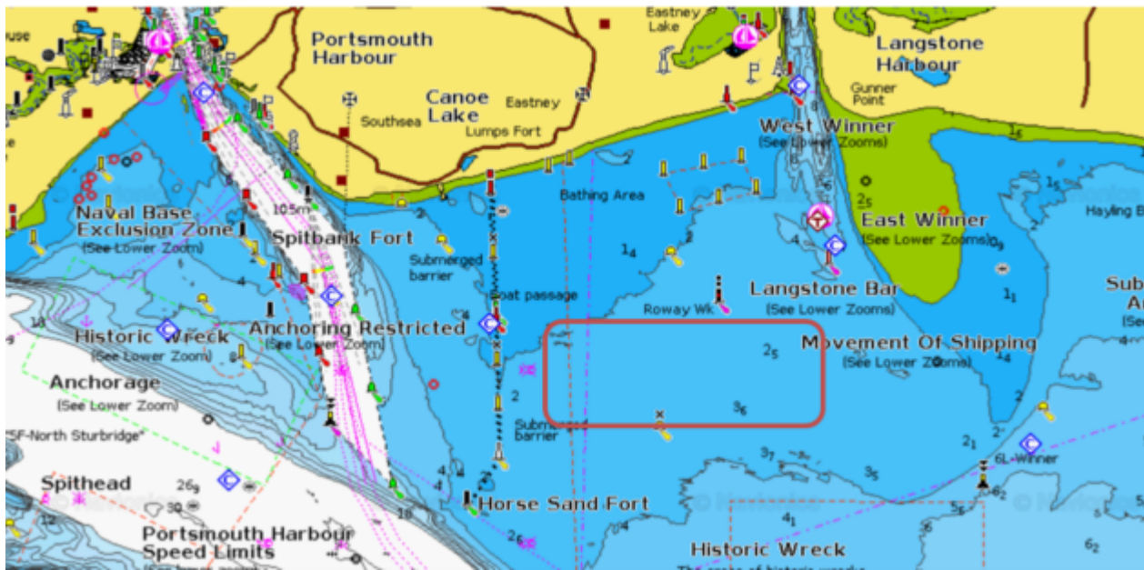
Fig 5. Roway Wreck Area: