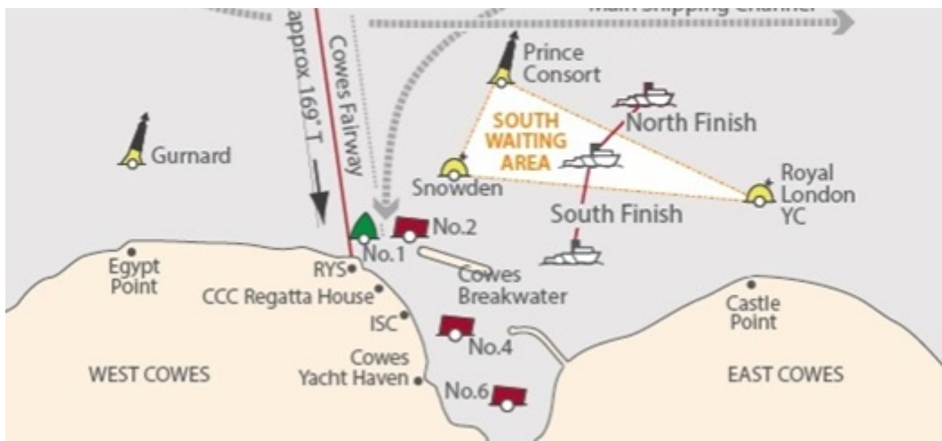
Figure 1 – Central Solent Start Area

f. When rounding Seaview all competitors must remain to seaward of the mooring area indicated on Figure 2. The area is indicated by a box originating from the shoreline at the north end of Seagrove Bay (the white flats) in approximate position 50^{\circ}43.00'N , 001^{\circ}06.30'W , out to 'Pier Head' which is a yellow spherical buoy (in approximate position 50^{\circ}43.31'N , 001^{\circ}05.63'W ), northwest to the 'Line Post' which is a yellow post with blue windsock (in approximate position 50^{\circ}43.60'N , 001^{\circ}06.23'W ), then directly back to the shoreline at Seaview Duver. One orange inflatable will be laid on the eastern side of the box and three orange inflatables will be equally spaced between Pier Head and the Line Post on the northern side of the box. Competing yachts disregarding the box and entering the Seaview mooring area will be subject to protest.