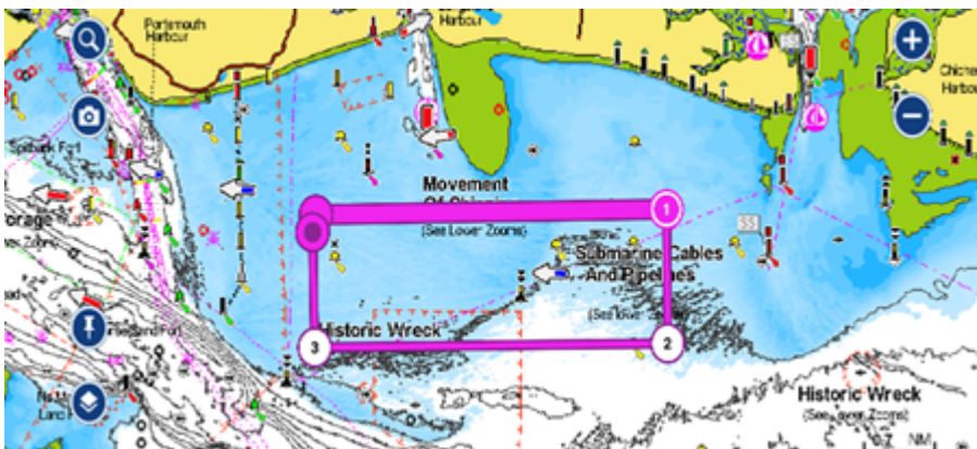
Hayling Bay trials area (Chart not to be used for navigation)