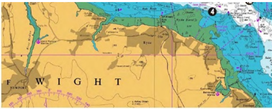
Figure 2 - The Solent