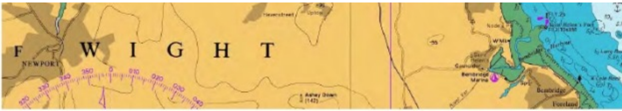
Figure 2 - The Solent

3. The work will be carried out by the vessel "SD INSPECTOR" a small Multicat operated by SERCO. Operations will be weather dependant and only conducted during the hours of daylight. Appropriate COLREGS signals will be displayed while the vessel is conducting survey operations. Each sampling period is expected to be no more than 15 minutes in duration.